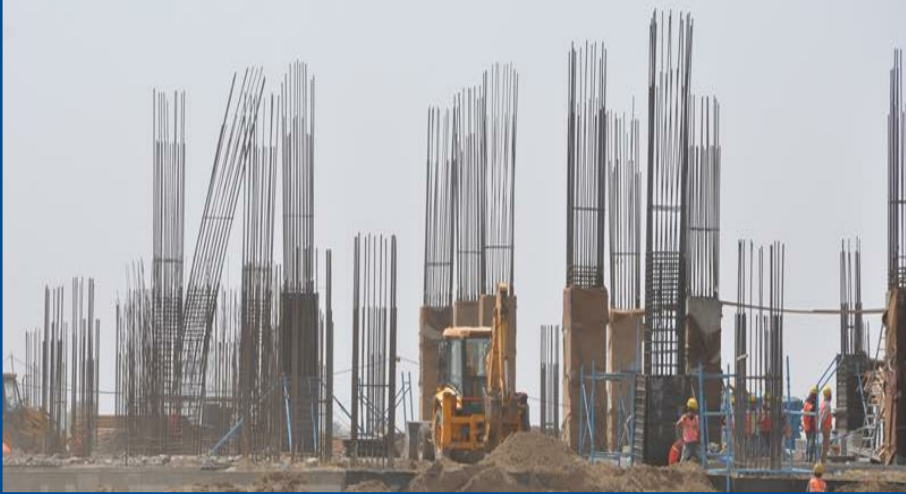
•ABCD(Dholera SIR TP-2) Building Work Progress Dated 05/04/2017