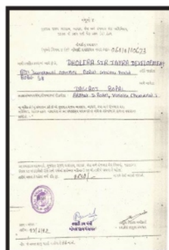
Registration Certificate Shops & Establishments