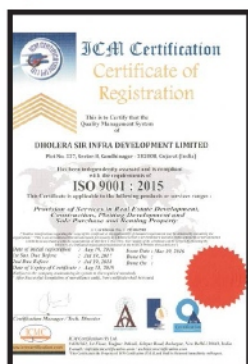
ISO 9001 Certificate