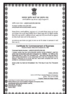
Commencement of Business Certificate